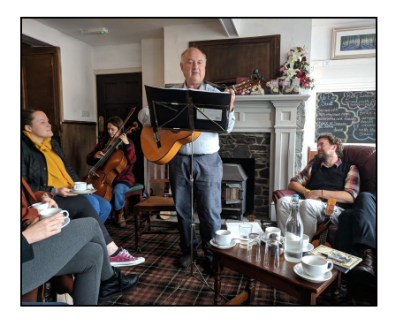
Louis de Bernieres and the Bookshop Band

This year saw more than 200 events and activities for all ages, including music, theatre, food and visual arts.